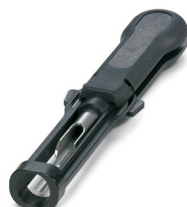
Contact removal tool, for turned CK 2,5... contacts

Please be informed that the data shown in this PDF document is generated from our Online Catalog. Please find the complete data in the user documentation. Our General Terms of Use for Downloads are valid.